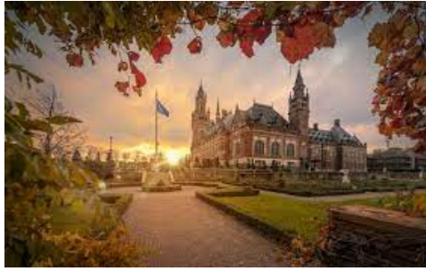
The Hague, Netherlands