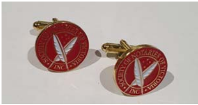
cufflinks - click here