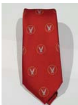
Member tie - click here