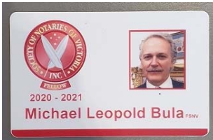
I D card - click here