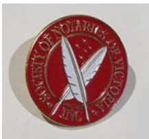
scarf or lapel pin - click here